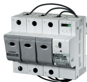
Linocur® 05863.063000 + 05860.100000